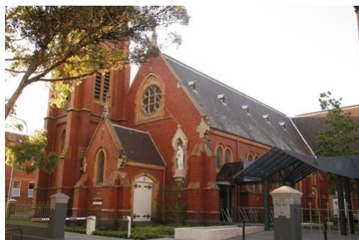
(just off Chapel St. near the Jam Factory)