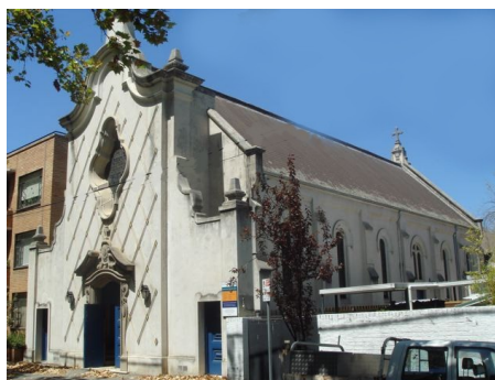
(near junction St. Kilda Rd & Toorak Rd.)